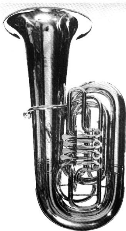
HB-5 CC, 4 VALVE MODEL