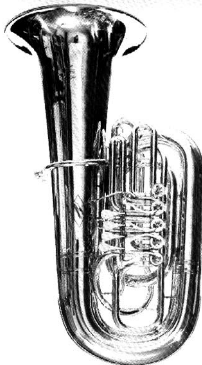
HB-6 CC, 5 VALVE MODEL

Hirsbrunner uses modern hydraulically operated equipment. Through the use of this sophisticated equipment, Hirsbrunner is able to control the quality and preciseness of every part that he makes.